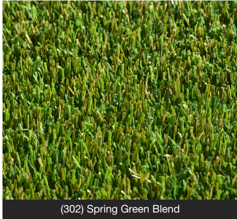
(302) Spring Green Blend